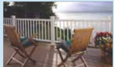
Decking and Railing