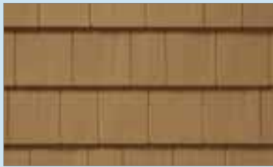
Polymer Shakes & Shingles

CertainTeed products are designed to work together and complement each other in color and style to give your home a beautiful finished look.