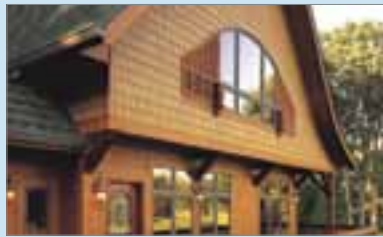
Fiber Cement Siding