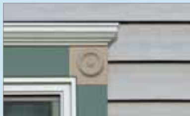
Vinyl Carpentry® Trim