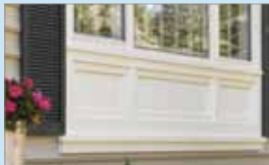
PVC Exterior Trim & Beadboard