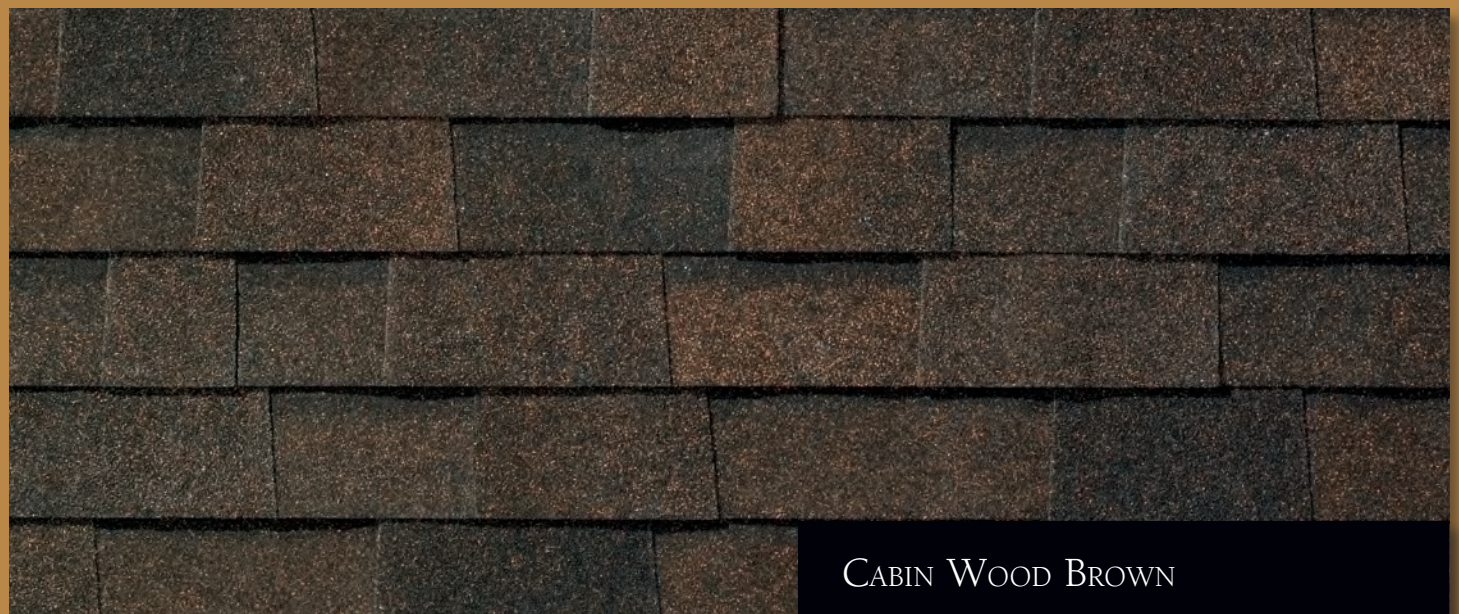
CABIN WOOD BROWN