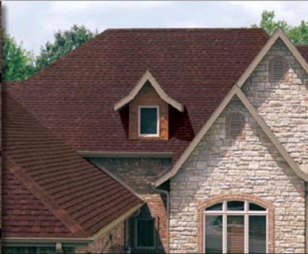
RUSTIC REDWOOD CLASSIC HERITAGE COLORS