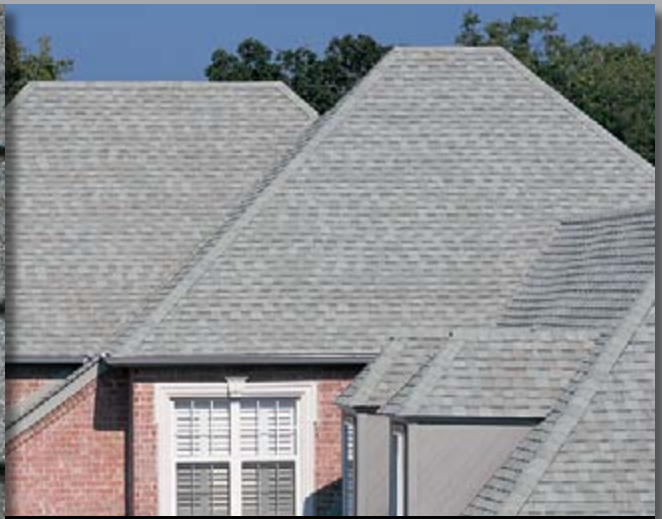
OLDE ENGLISH PEWTER CLASSIC HERITAGE COLORS