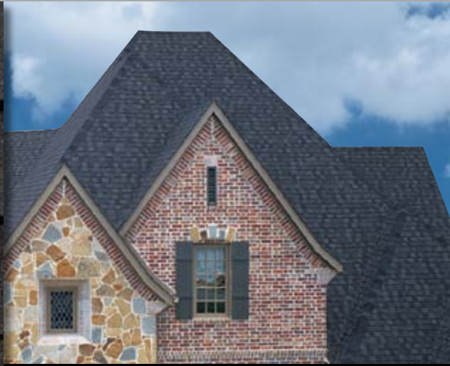
BLACK WALNUT AMERICA'S NATURAL COLORS®