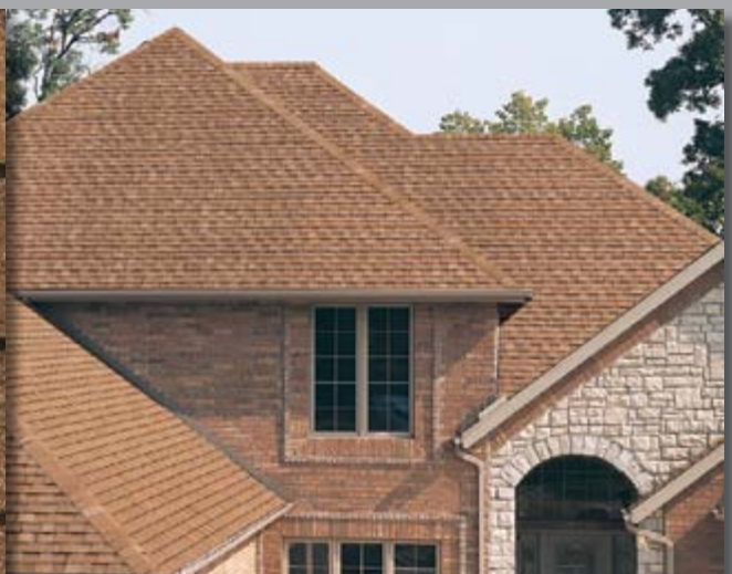
RUSTIC CEDAR CLASSIC HERITAGE COLORS