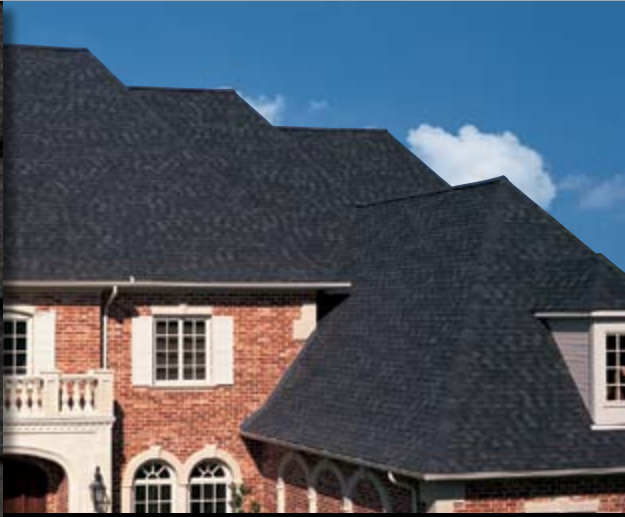
RUSTIC BLACK CLASSIC HERITAGE COLORS