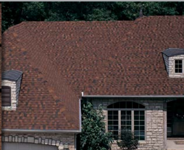
AUTUMN BROWN AMERICA'S NATURAL COLORS