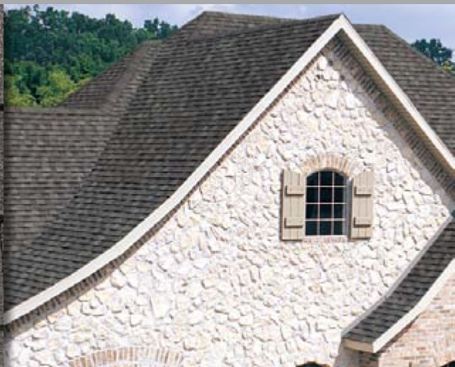
AGED WOOD CLASSIC HERITAGE COLORS