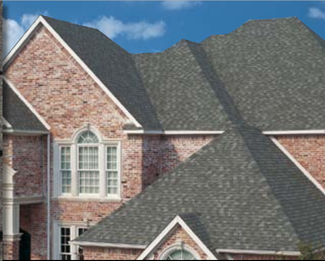
OXFORD GREY CLASSIC HERITAGE COLORS