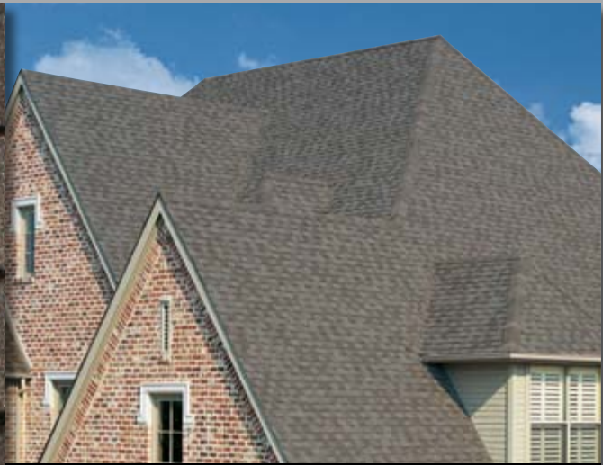
WEATHERED WOOD CLASSIC HERITAGE COLORS