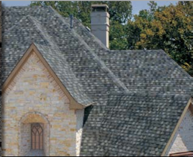
THUNDERSTORM GREY AMERICA'S NATURAL COLORS