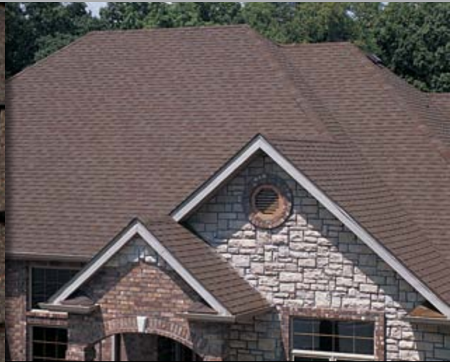
RUSTIC SLATE CLASSIC HERITAGE COLORS