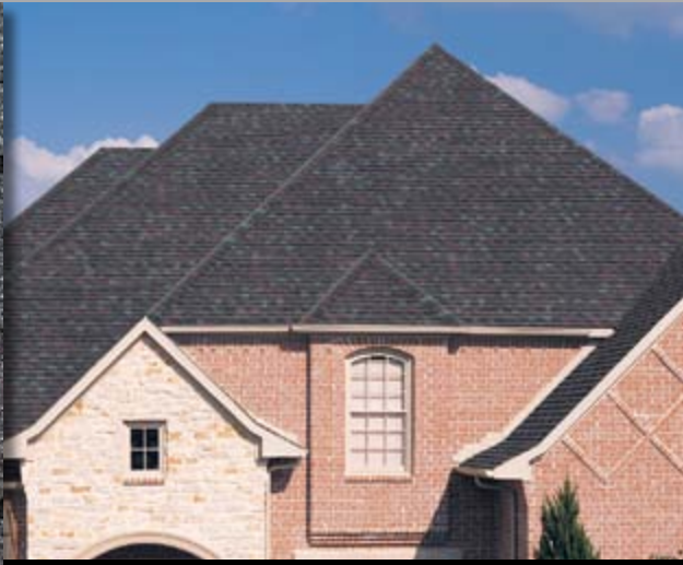
SLATETONE GREY CLASSIC HERITAGE COLORS