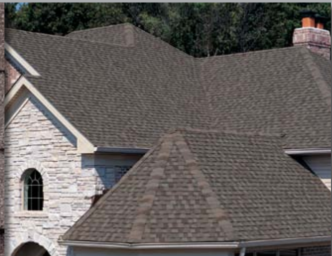
NATURAL TIMBER AMERICA'S NATURAL COLORS®