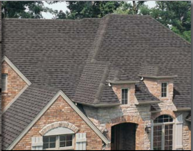
VIRGINIA SLATE CLASSIC HERITAGE COLORS