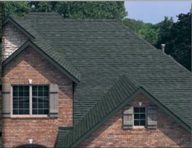
RUSTIC EVERGREEN CLASSIC HERITAGE COLORS